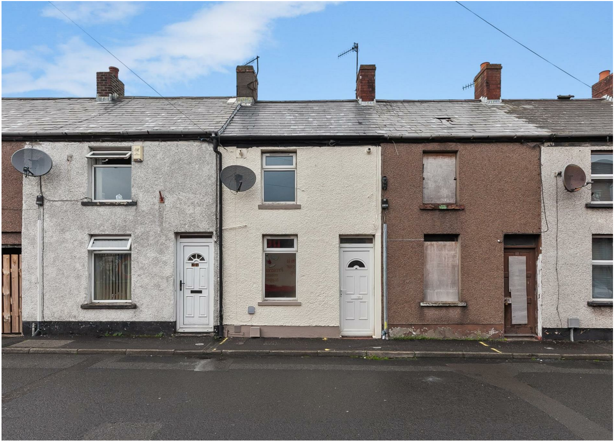
26 Lower Waterloo Road, Larne, BT40 1NP